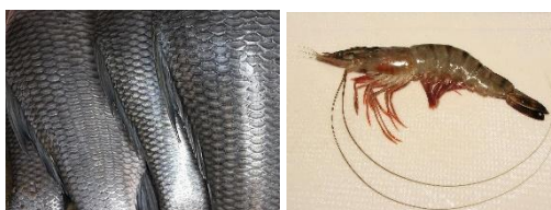
(a) Fish with scales (b) Prawns